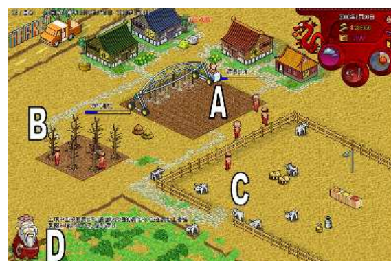
Figure 2. The game-play interface of FARMTASIA

(A) Cropland (B) Orchard (C) Rangeland (D) Wise Genie