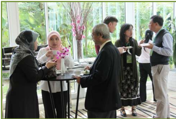
Delegates networking during the tea break