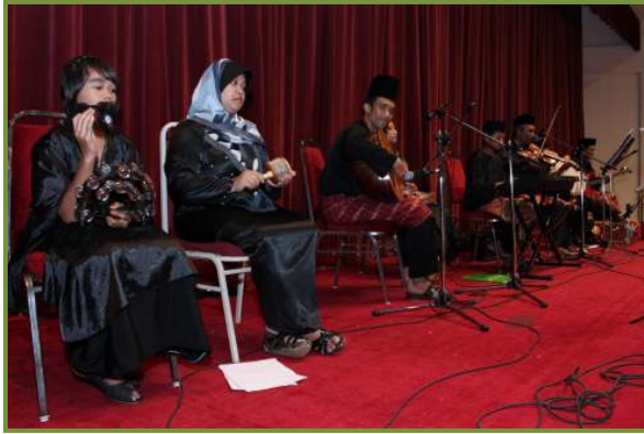
Traditional performances at the banquet dinner