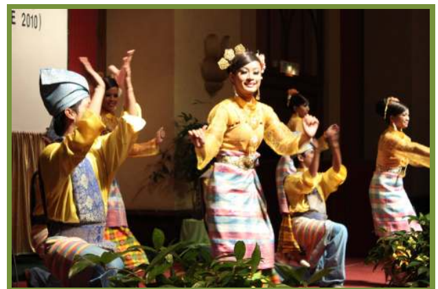
Cultural dances at the opening ceremony