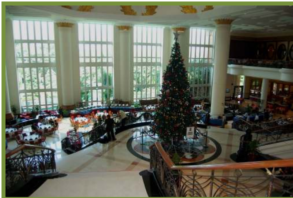
Conference venue adorned in festive decorations