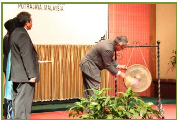
The Vice Chancellor of Universiti Putra Malaysia officiating ICCE 2010