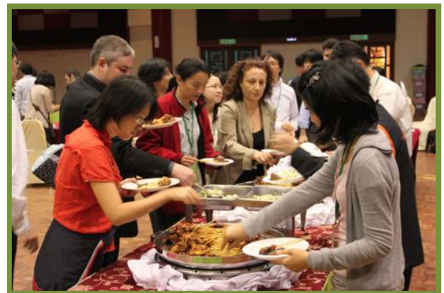
Delegates savouring the local cuisine at the banquet dinner